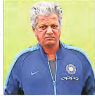
WVRAMAN, FORMER INDIA BATSMAN AND COACH

RATHER THAN ASKING WHY WE DON'T GET TURNING TRACKS IN DOMESTIC CRICKET, WHY ARE WE NOT GIVING GOOD TRACKS FOR TEST CRICKET?