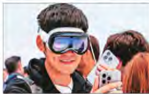
Apple also plans to revamp the Vision Pro headset

APPLE IS EXPLORING a push into smart glasses with an internal study of products currently on the market, setting the stage for the company to follow Meta Platforms into an increasingly popular category.